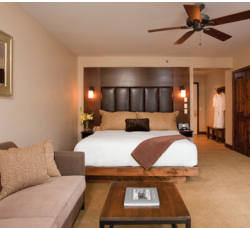
STUDIOS & SUITES