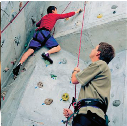
INDOOR ROCK WALL