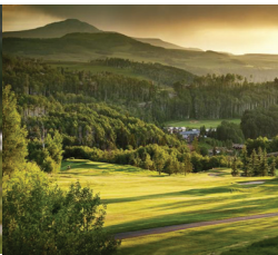
PREFERRED TEE TIMES